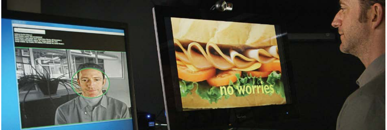
Figure 3. NEC® RCM can be used to tailor content based on audience behavior and characteristics.