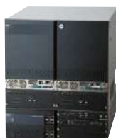
UNIVERGE SV9500, TSW-BOX, PIR (7U) (New PIR)